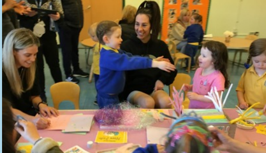
Developing School Grounds