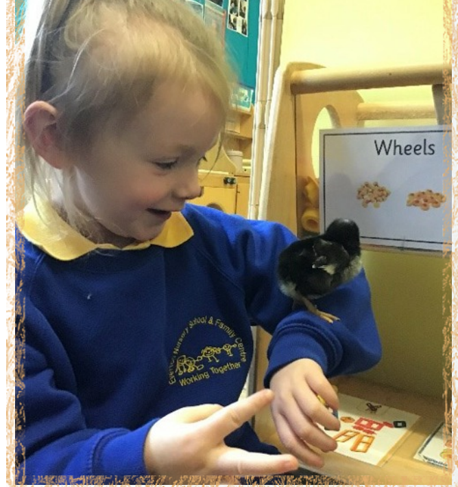
Five Little Ducks