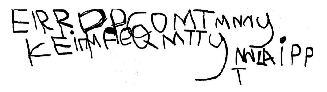
"I got a box of cornflakes" - Claire, aged 4