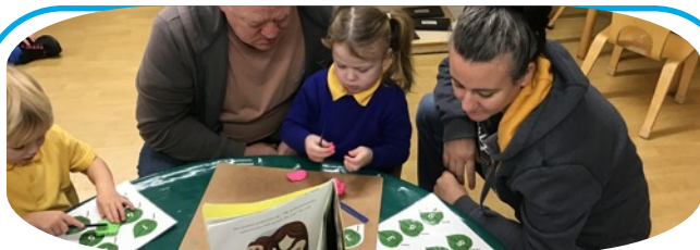
Mathematics in Early Years