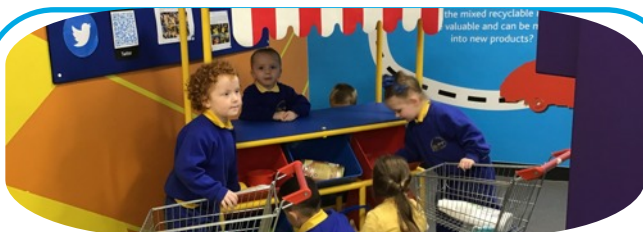
Gillmoss Recycle Discovery Centre